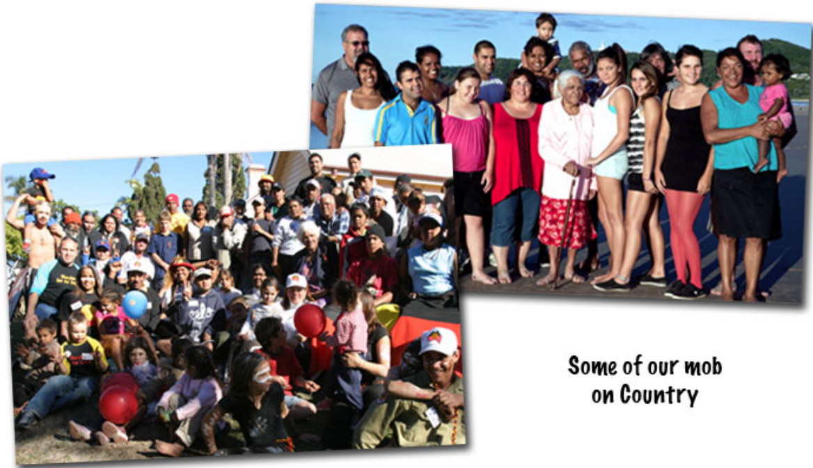
Some of our mob on Country

“We want to see Country how it used to be. We want to continue to look after country and want it to look after us. We want our people to be back on Country, caring for and using Country like we always have. We want to share parts of our culture with the wider community so they learn about and respect Country like we do. We want everybody to work together to keep Country clean and healthy.”